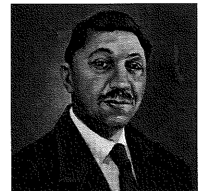
Abraham Maslow (1908–1970) "Any theory of motivation that is worthy of attention must deal with the highest capacities of the healthy and strong person as well as with the defensive maneuvers of crippled spirits" ( Motivation and Personality , 1970, p. 33).

self-actualization according to Maslow, one of the ultimate psychological needs that arises after basic physical and psychological needs are met and self-esteem is achieved; the motivation to fulfill one's potential.