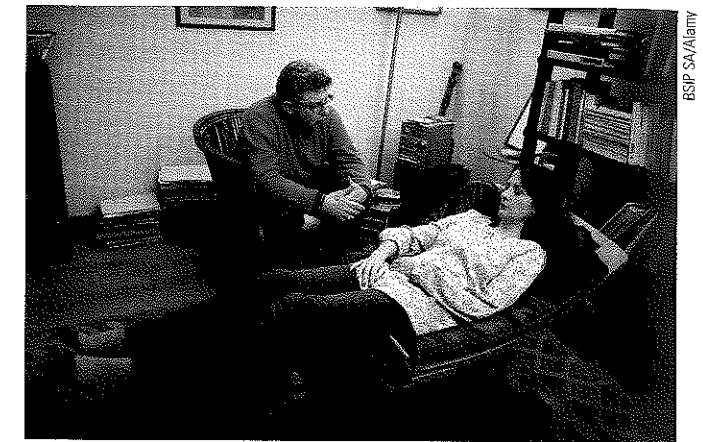
Hypnotherapy This therapy aims to help people uncover problem-causing thoughts and feelings, or to change an unwanted behavior.

Hypnosis inhibits pain-related brain activity. In surgical experiments, hypnotized patients have required less medication, recovered sooner, and left the hospital earlier than un hypnotized control patients (Askay & Patterson, 2007; Hammond, 2008; Spiegel, 2007). Nearly 10 percent of us can become so deeply hypnotized that even major surgery can be performed without anesthesia. Half of us can gain at least some pain relief from hypnosis. The surgical use of hypnosis has flourished in Europe, where one Belgian medical team has performed more than 5000 surgeries with a combination of hypnosis, local anesthesia, and a mild sedative (Song, 2006).